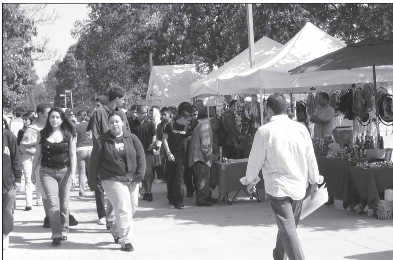
Oxnard College Multicultural Arts Day