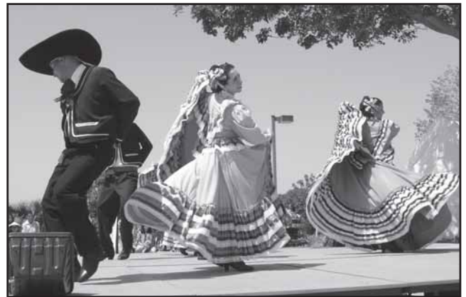
Scenes from Oxnard College Multicultural Arts Day