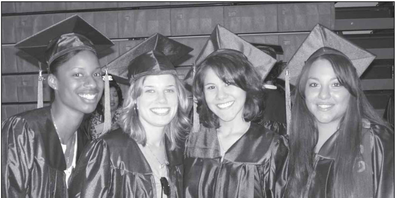
Oxnard College 2005 Graduation

Under existing Veterans' Administration regulations, a student repeating a course is not eligible for veterans' benefits in most cases. Veterans should, therefore, check with the Veterans' Assistant in the Admissions & Records Office before repeating a course.