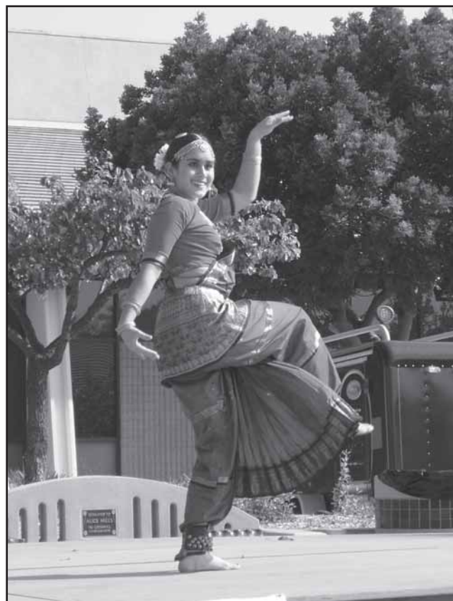
Oxnard College Multicultural Arts Day

California Lutheran University General Education Requirements are listed on page 56-57.