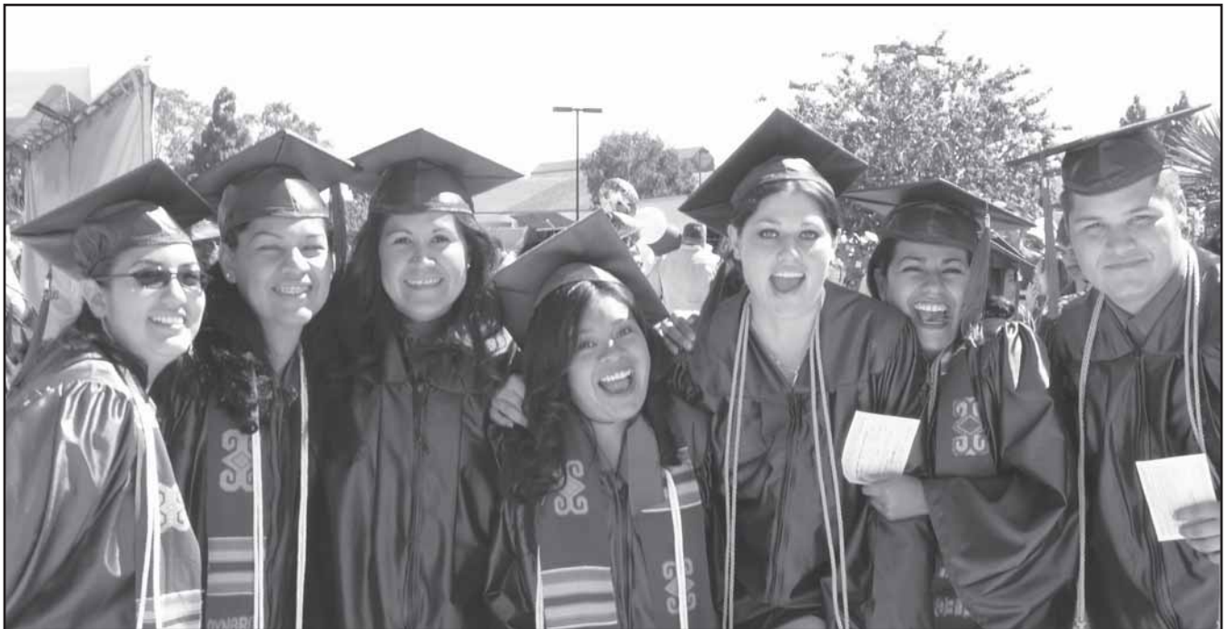
Oxnard College 2005 Graduation

Successful completion of course(s) prepares students to take necessary exams.